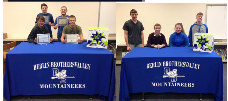
Above: Mountaineer PRIDE cards on display. Below: Students of the Month for September (Left) and October (Right).